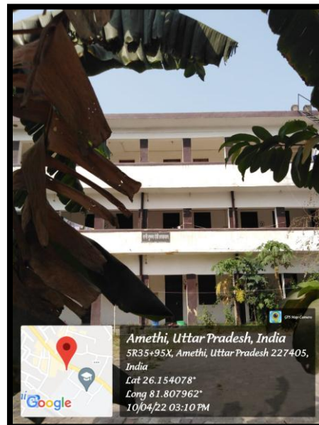
Rani Shushma Girls Hostel