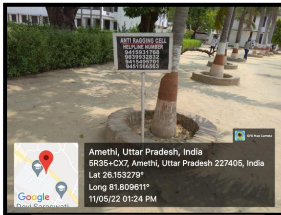
Women Anti Ragging Cell