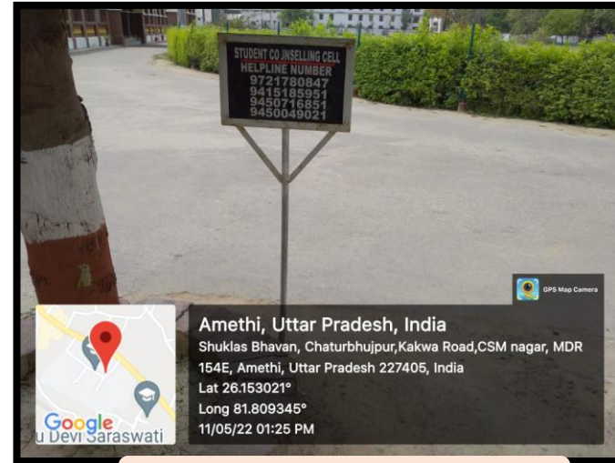
Student Counselling Cell