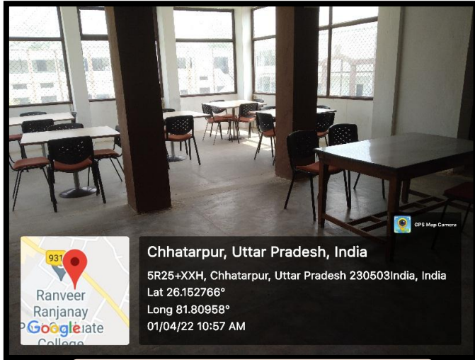
Girls Reading Room