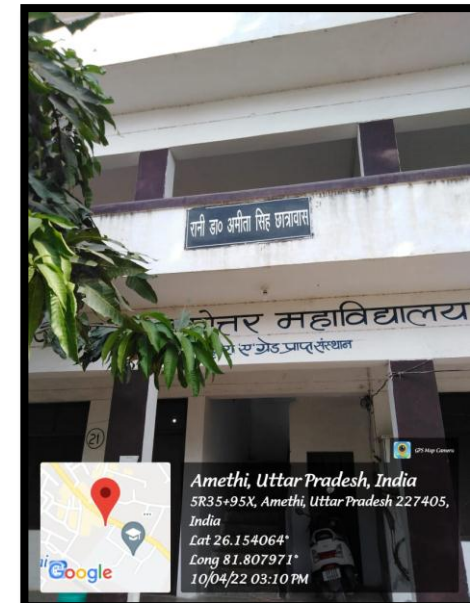
Rani Dr. Ameeta Singh Girls Hostel